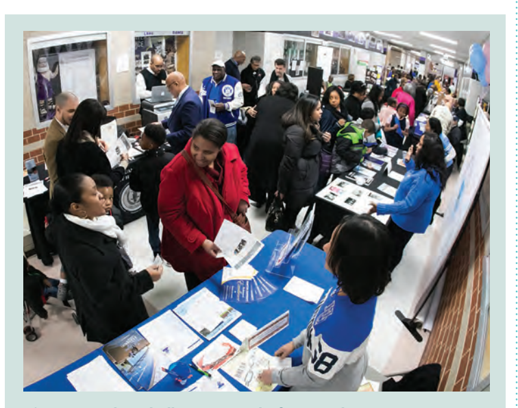
The National Panhellenic Council of Howard County partners with HCPSS to hold an annual Black History Expo that highlights valuable contributions made by African American citizens to ensure the freedoms and prosperity that all Americans cherish. Approximately 25 HCPSS partners, including sororities, fraternities, faith-based institutions and community organizations, provide exhibits. Students participate through song, dance and speech performances and in the Black History Jeopardy Competition.